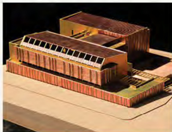
A brass and copper model of the centre

'It is inspiring that the JHGC has been invited to be part of a network where we can both share our expertise as well as work in a way that will enrich our sense of belonging to a wider African community.'