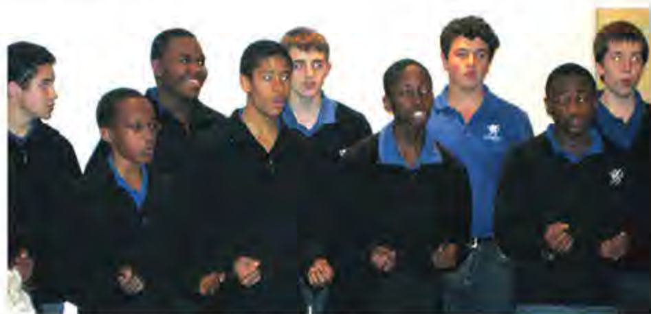
Following a tour and educational programme at the DHC, the Drakensberg Boys Choir sang in appreciation of their visit