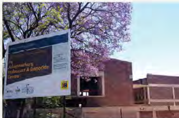
Watch us grow www.facebook.com/JHGCentre