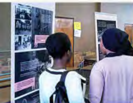
A group from Sedibeng College views the Korczak exhibition at a JHGC education workshop

Janusz Korczak, Warsaw 1878–Treblinka 1942