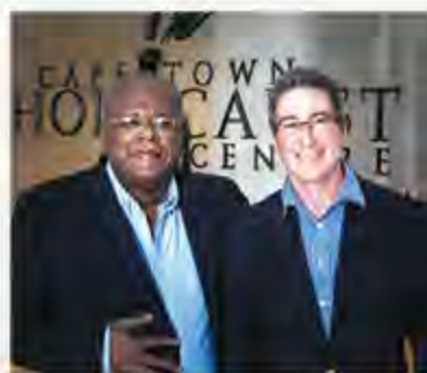
SAHGF Patron Professor Jonathan Jansen visiting the CTHC