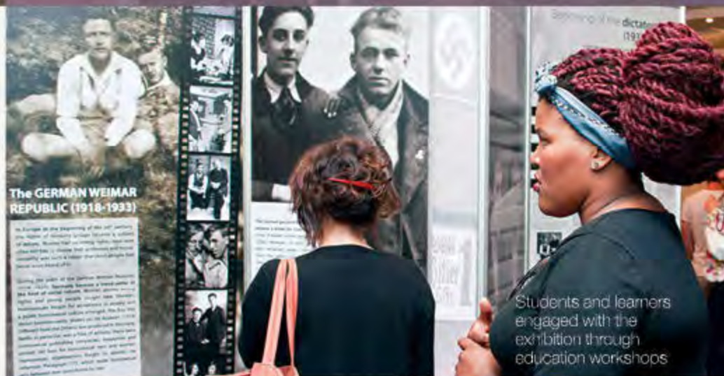
Students and learners engaged with the exhibition through education workshops