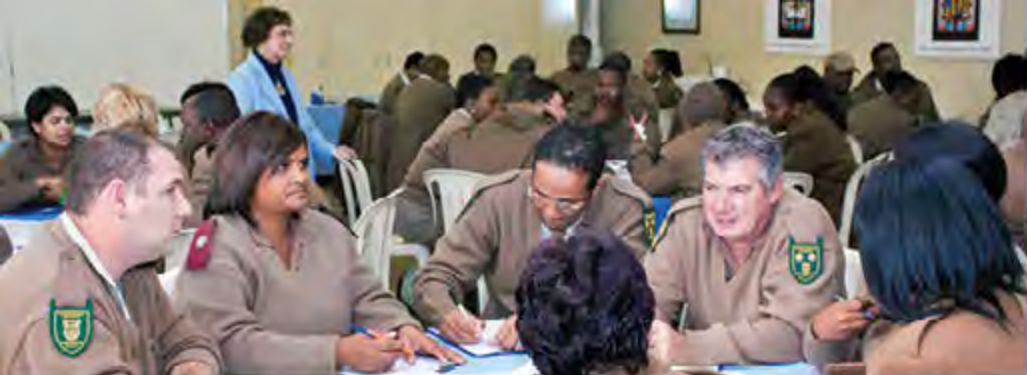
A SAHGF workshop with Correctional Services