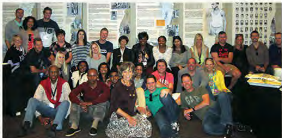
A Corporate Diversity Training Workshop with members of the Investec Durban Team