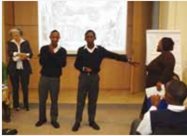
Hopalong learners in a workshop in The David Susman Seminar Room