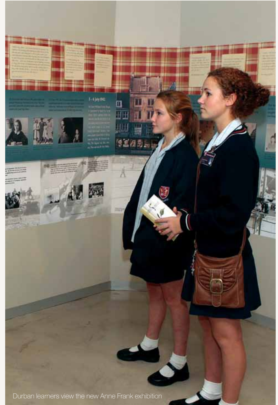
Durban learners view the new Anne Frank exhibition