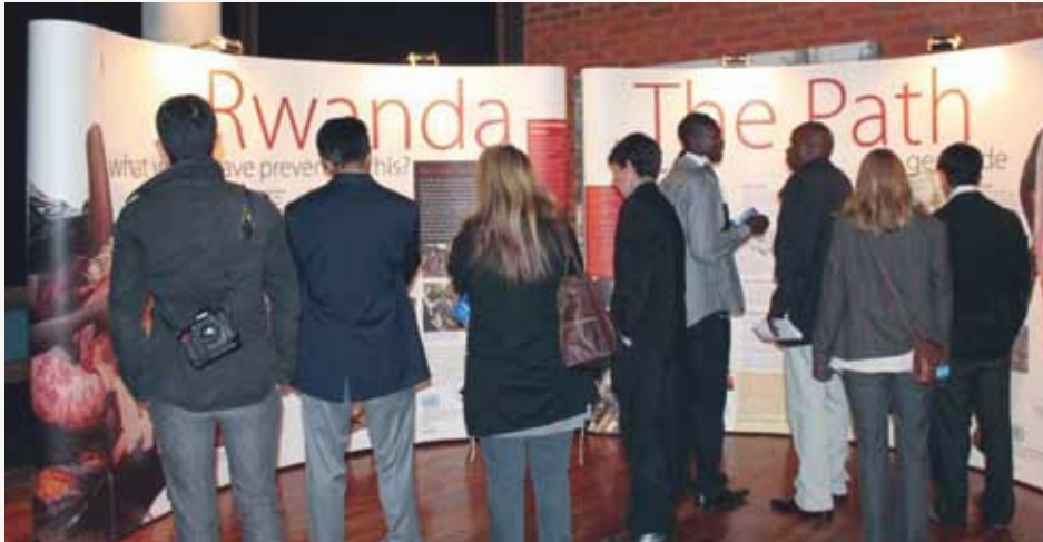
Lessons from Rwanda exhibition at Liliesleaf Museum, Rivonia

The SAHGF is committed to raising awareness of the history of genocide and its prevention.