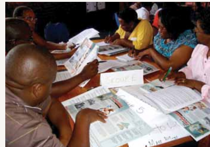
Educators at a workshop in Butterworth, Eastern Cape engage with materials developed by the SAHGF

Participants are unanimous in their praise of the workshops, and express a growth in confidence in their ability to teach not only the history of the Holocaust, but history in general.