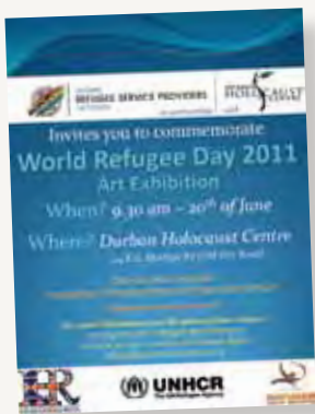
On 20 June, World Refugee Day, the DHC hosted a schools' art competition in partnership with UN Refugee Services Providers Network with the theme One refugee without hope is one too many . The high standard of work was on exhibition in the Centre's new seminar room.