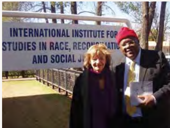
Dr Eva Hoffman with Professor Jonathan Jansen, Rector of the University of the Free State