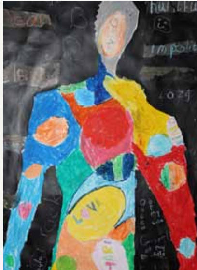
Learners from the Frank Joubert Art Centre created works in response to the themes of Brundibár

After the Artscape performances, Brundibár was taken to outlying communities and reached close on 1 000 learners.