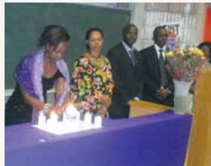
The Rwandan commemoration at CPUT, Cape Town

The SAHGF is committed to raising awareness of the history of genocide and its prevention.