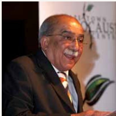
Patron, Professor Kader Asmal