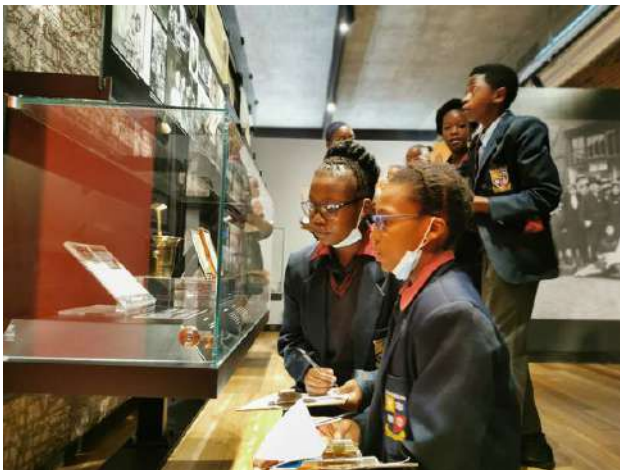
Learners from Masibambane College, Orange Farm, examining objects in the JHGC permanent exhibition.

“Thank you for helping me discover a part of myself I never knew I had. I leave this space a young educated black women who wants to change the world into a better place. More people need to be taught about this because it’s apart of us and not knowing is like not knowing a part of yourself.”