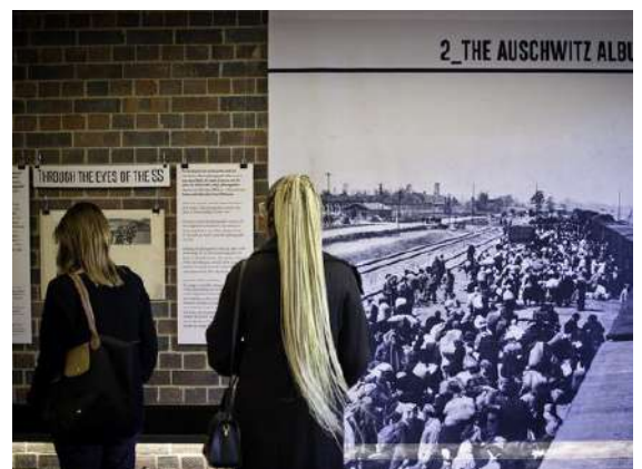
Visitors at the opening of Seeing Auschwitz at the JHGC.