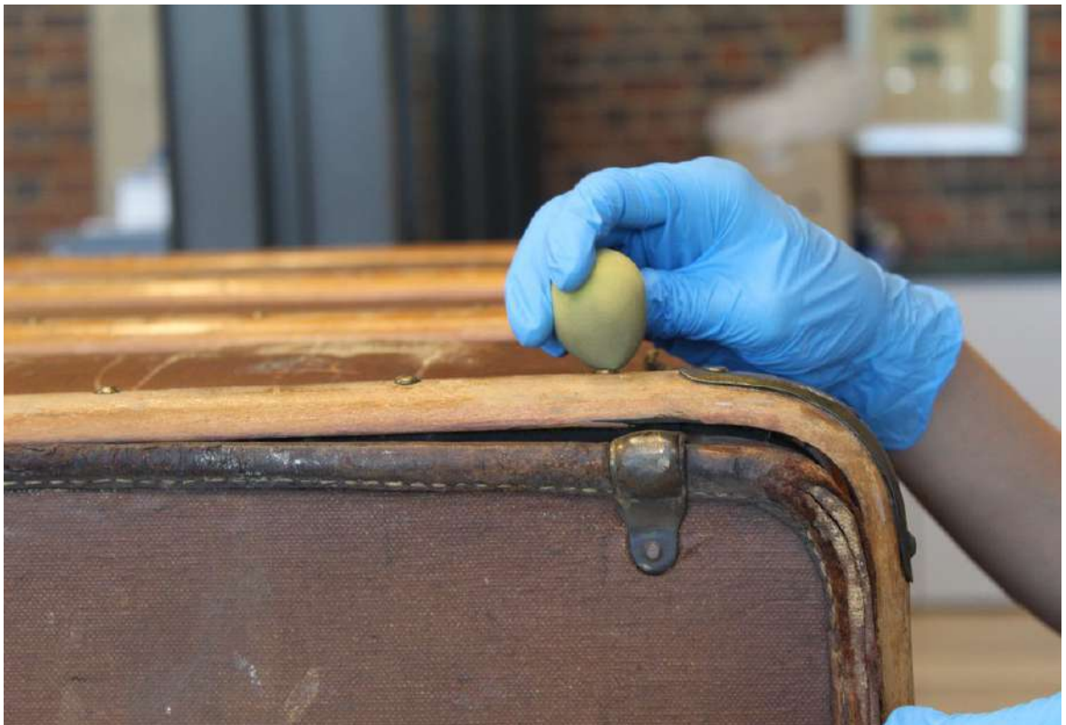
A volunteer conservator cleaning a trunk belonging to Holocaust survivor Doris Lurie.

We also continue to explore the collection's interesting artefacts and stories in our popular ArchiveFriday series on social media. We invite you start exploring our collection on e-Hive. Please continue to check back as we continue to add more artefact