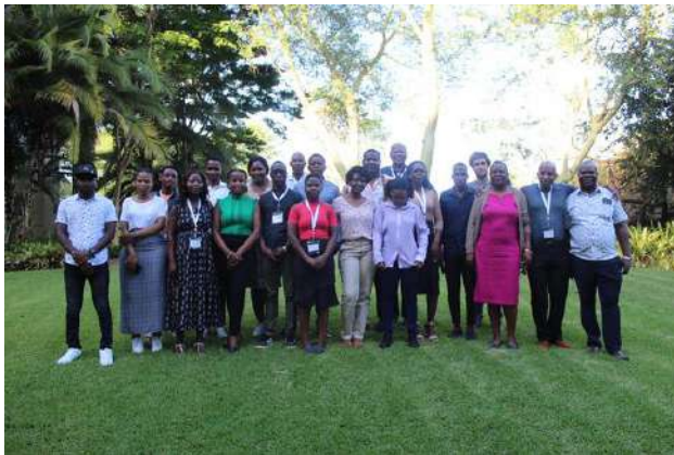
Delegates at the DEPA conference in March 2023 in Mbombela.