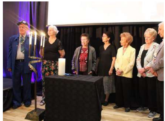
Holocaust survivors stand together after a candle lighting ceremony at International Holocaust Remembrance Day, 26 January 2023.