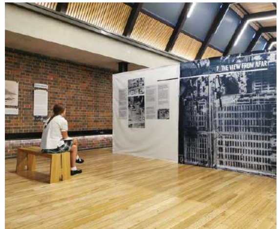
A grade 9 learner from Kingsmead College, engaging with the Seeing Auschwitz exhibition.